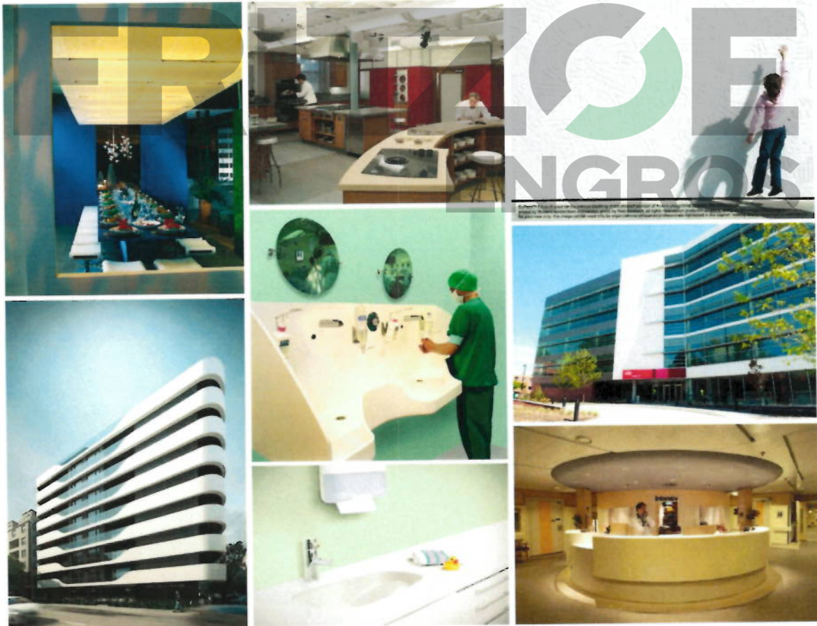
Figure 1: Corian® solid surface in its various applications